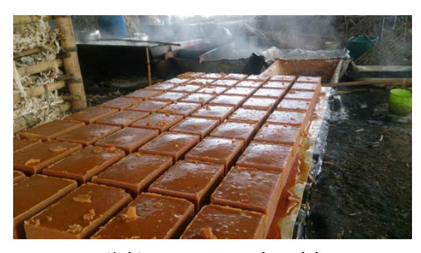
Making sugar cane (panela)

It's a great area for day hikes (or go by horse, or car) that lead you from one archaeological wonder to another: El Purutal, La Tablón and La Chaquira.