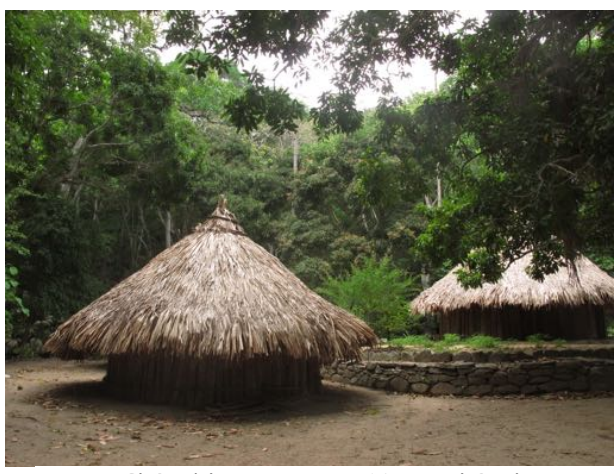
El Pueblito, Tayrona National Park

The main town is Santa Marta, which lilts to the sound of musicians and singers entertaining people drinking on café terraces, as the languid evenings lull you to enjoy Santa Marta's plazas and streets.