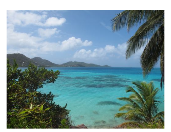
Providencia sea and views

Located some 500 miles/800km from the Colombia coast, these two islands are more Caribbean than Colombian and have their own cultures and feel.