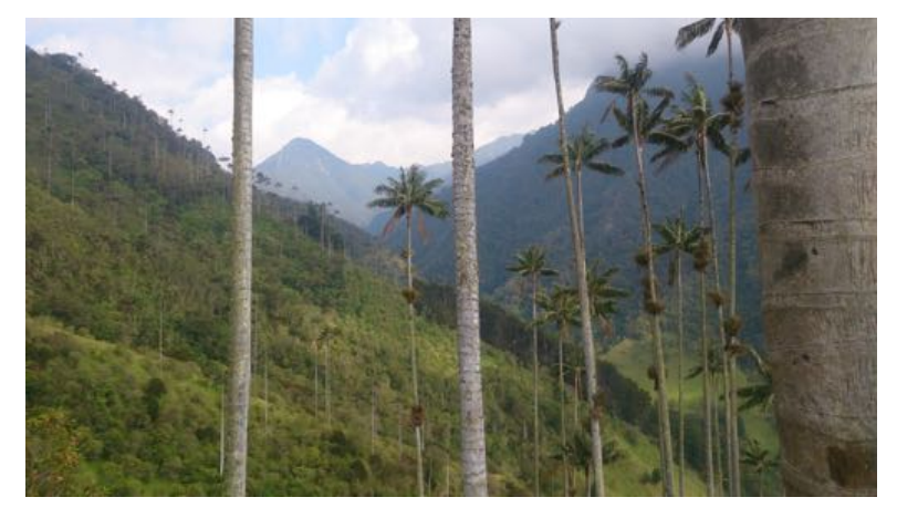
Wax palm, Colombia's national tree, Cocora

It's a stunning walk through one of the world's highest, most ecologically diverse coastal mountain ranges. The highest point is Pico Cristóbal Colón, the highest mountain in Colombia, at 5,790 metres and with permanent snow cover and 42 km / 30 miles from the coast.