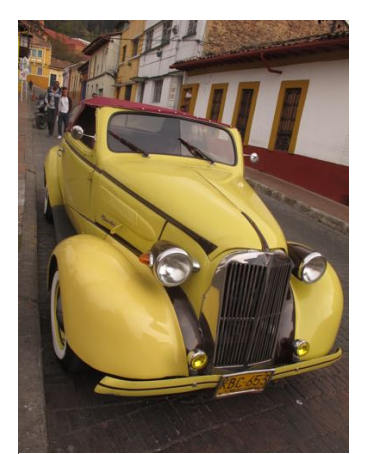
Bogotá street scene

Close by to Bogotá is The Salt Cathedral of Zipaquirá, an underground Roman Catholic church built within the tunnels of a salt mine 200 metres (220 yd.) underground.