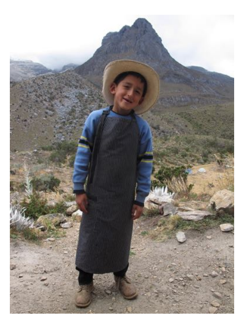
Spectacular mountains and people

The cities are cosmopolitan and cultured, replete with incredible museums with enormous collections.