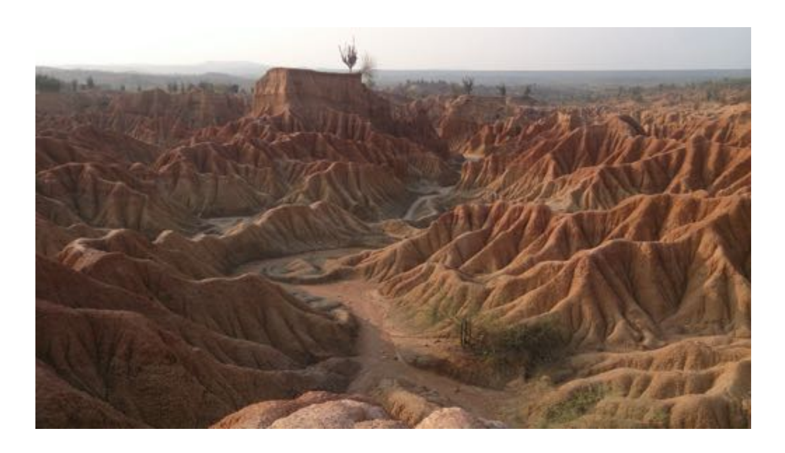
Tatacoa desert at sunrise

Puerto Nariño is a small town located 80km up river from the frontier town of Leticia. Puerto Nariño is a car-less and quiet town that provides a perfect spot to explore for a few days.